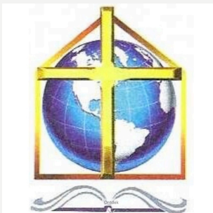
Iglesia Aliansa Evangelica