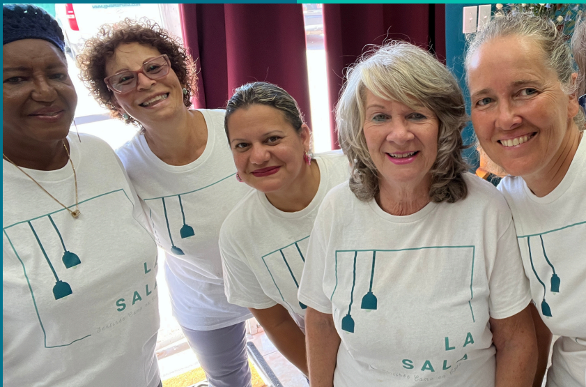
Many Volunteers La Sala Womens Ministry