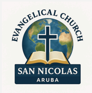
Evangelical Church San Nicolas