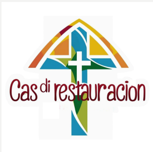
Cas di Restauracion