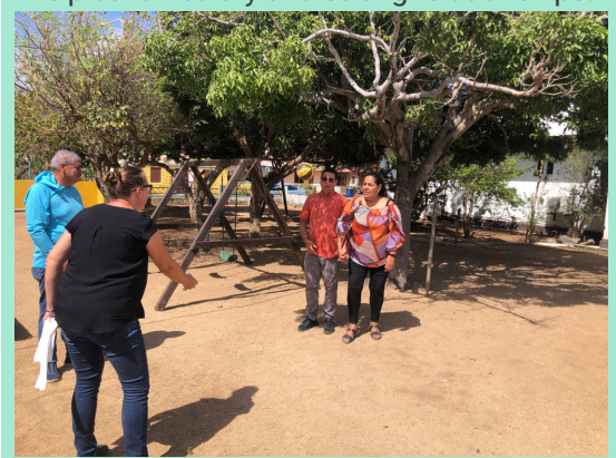
Sometimes this means literally building..

We are grateful we had the opportunity to help build healthy and strong relationships.