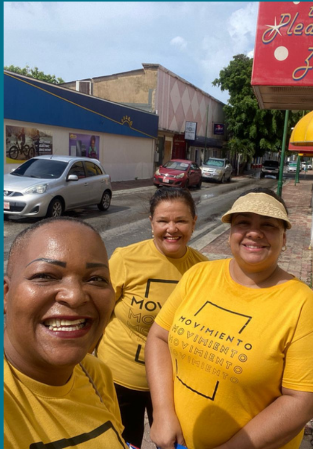
Many Volunteers La Sala Womens Ministry