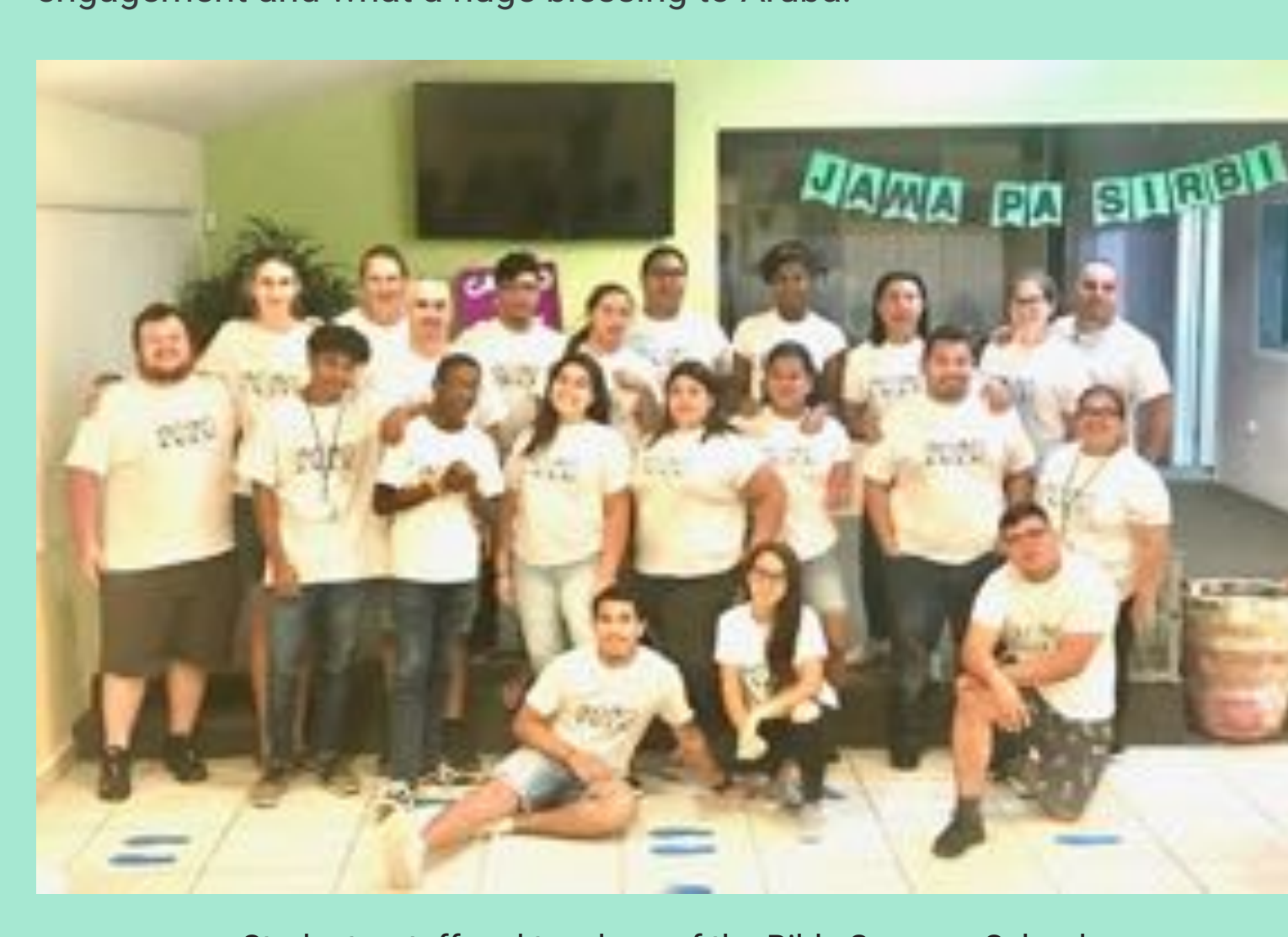
Students, staff and teachers of the Bible Summer School.

What a glorious week we had! This Summer we were teaching in a Bible Summer School called "Misionero Riba Mi Isla" (Missionary on my island). This school was organized by Iglesia Piedra Plat. The organizing team had invited us to help them organize this school and teach in it. We felt honored! In just four weeks everything was arranged. Thirteen young people (age 15-25) attended the school. The subjects of the teaching were: Identity in Christ, Hearing the voice of God, You got served first, Circles of ministry and the Great commission. On Saturday we had an outreach, on Sunday a youth service. It was so wonderfulp to see all these young people being hungry to know more of God and to making Him known. What an engagement and what a huge blessing to Aruba.