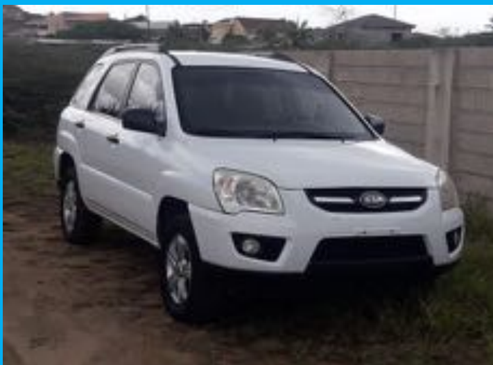
God blessed us with a car!