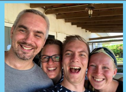
Our first visitors!