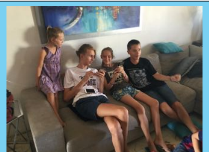
Making new friends!